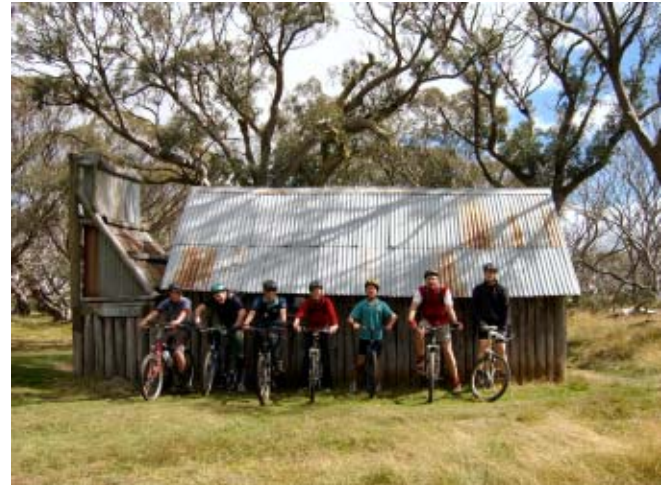
Most of our group at Wallace's Hut