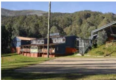
Howmans Gap YMCA Camp