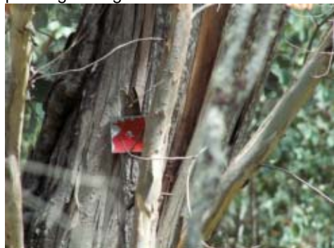
First Track Marker

giant to the next and we made a straight line up the hill. The fallen trees allowed us quite fast progress compared to pushing through the scrub.