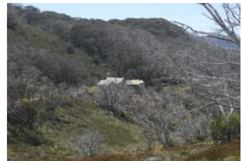
The Bogong Rover Chalet