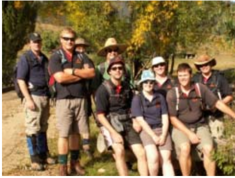
Our Group before the walk