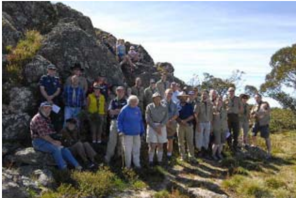
All of us after the Rovers Own on Sunday

The 75 th Anniversary of Rover Skiing Alpine Rover Crew Reunion was held at Howman's Gap YMCA Camp on the Labour Day long weekend. About 50 people joined us at Howman's Gap, along with many more who called in to the Chalet for a tour and to look at historical displays.