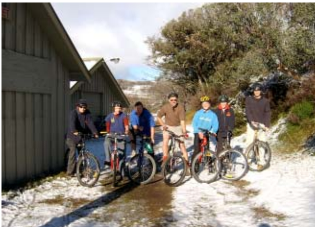
Snow on Sunday Morning