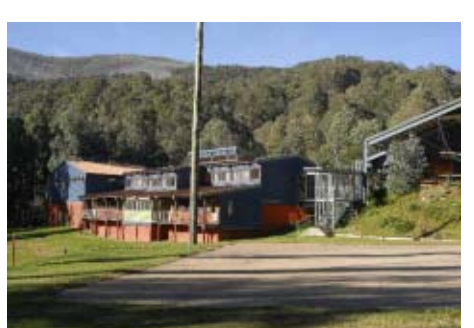
Howmans Gap YMCA Camp

Sunday we had a Rovers Own Service out at Investiture Point. It was a thought provoking service on the past,