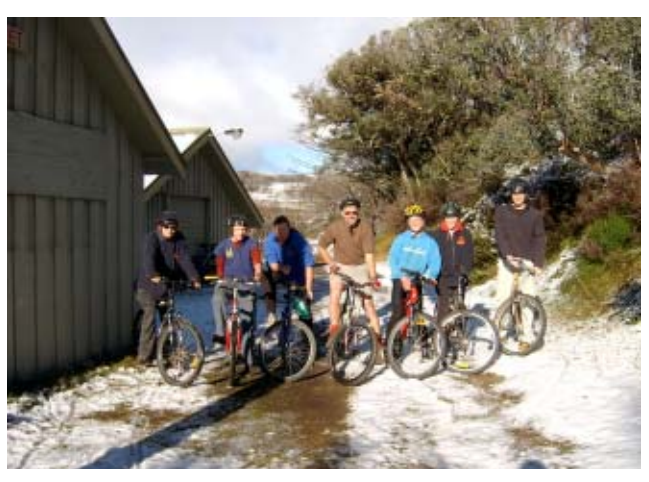
Snow on Sunday Morning

On Thursday we drove up from Melbourne and Geelong and met the Otway Plains Venturers in Bright who'd ridden the rail trail to Bright. Had soup and went to bed.