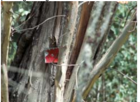
First Track Marker

At about 4pm we saw the second set of trail marker, and stopped for a well earned afternoon tea break. Relieved that we were still on course, chocolate never tasted so good. We only found a couple of markers, and no sign of a foot track, so decided to continue finding our own route to the chalet. After the walk, by comparing the gps plot to an old map, I think we had spent 3 hours on the wrong spur. This didn't matter as we'd ended up on track, and looking at the scrub, I don't think our progress would have been any quicker.