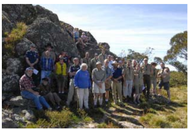
All of us after the Rovers Own on Sunday

The 75<sup>th</sup> Anniversary of Rover Skiing Alpine Rover Crew Reunion was held at Howman's Gap YMCA Camp on the Labour Day long weekend. About 50 people joined us at Howman's Gap, along with many more who called in to the Chalet for a tour and to look at historical displays.